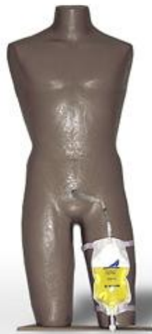
External Collection System